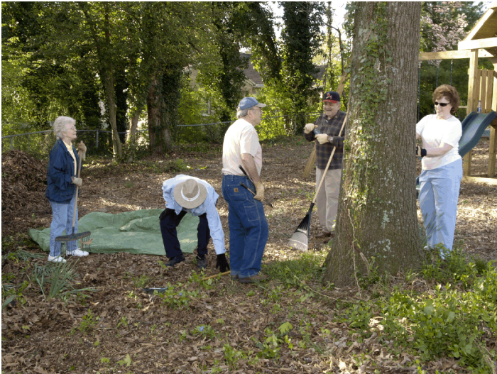
Alcoa Kiwanians hard at work at the Children's Advocacy Home

Service Project: Six teams from Big Brothers Big Sisters and West End Academy able to play Key Club Project: Twenty-two Bearden High Key Clubbers assisted as hole monitors/scorekeepers