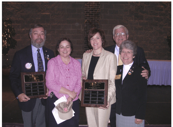
Kiwanis Recognized at Salvation Army Volunteer Luncheon for our Bell Ringing Battle of the Clubs $10,000 total, with Northside, 2 nd place and Knoxville 1 st place